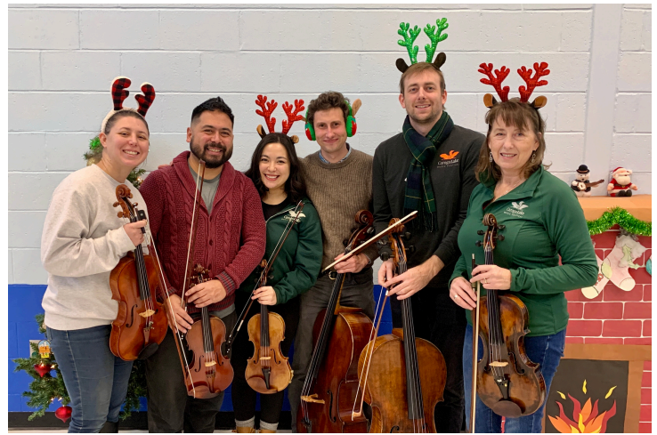
CLMF Resident Artists perform at Wheelerville Union Free School at the 2023 CLMF WinterFest

CLMF Resident artists will be performing in concerts throughout Fulton and Montgomery Counties . These concerts will feature classical holiday favorites like selections from Tchaikovsky's Nutcracker in addition to works of great composers such as Vivaldi, Ligeti, Piazzolla, Handel, Coleridge-Taylor, and more.